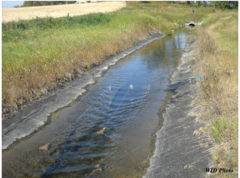
EcoSocks are proving to be beneficial for weed control in canals

Problems arise when the natural balance of an aquatic system is disrupted. EcoSocks are designed to help restore that balance. The EcoSock is attached by a rope to structures along the canals, and distribute bacteria that occur naturally in the environment into the water. Phyllis Day Chief, CEO of AWT explains, "EcoSocks are filled with environmentally friendly, naturally occurring soil bacteria. What we're doing is equalizing the balance in the body of water. The EcoSock out competes the algae