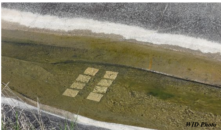
Algae growth test plates were situated upstream and downstream of the EcoSocks

AWT performed a scientific study this summer using test sites in the WID's canals. The WID is excited to see how the science supports their observations.