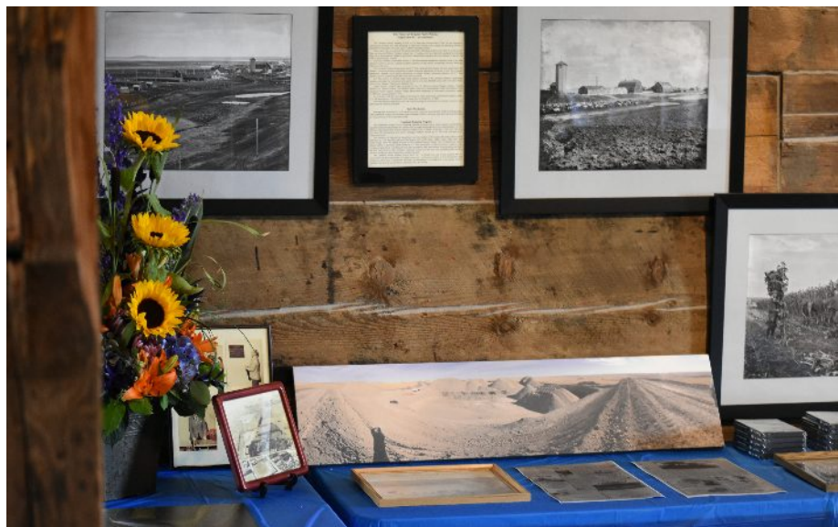
A collection of artifacts and photos highlighted the history of the WID and showcased the evolution of the infrastructure over time. The WID appreciates the irrigators, Board members and staff whose contributions over the years made the WID what it is today.